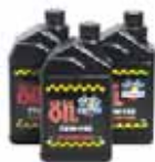
RICHMOND GEAR Synthetic Gear Oil

For Maximum Protection and Performance use Part # LUBE (pg 125)