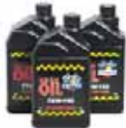
RICHMOND GEAR Synthetic Gear Oil

For Maximum Protection and Performance use Part # LUBE (pg 125)